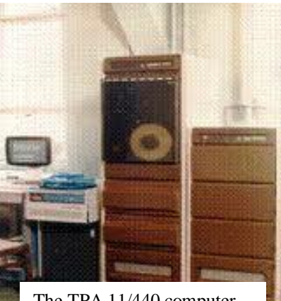
The TPA 11/440 computer